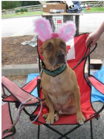
Bond a little confused on the event