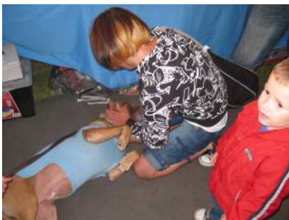
Bond getting a belly rub