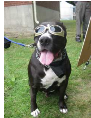
Diesel (a visitor to our booth) looking dapper in his Doggles!