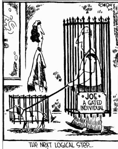
SPEED BUMP DAVE COVERLY

Please recycle this newsletter by passing it on to friends or leaving a copy at your vet's or groomer's!