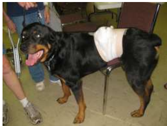
Dojo with a sucking chest wound