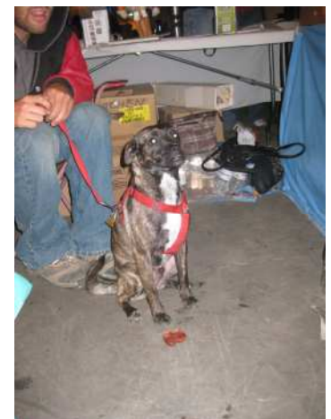
Leon sitting still for a change!