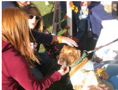
Bond recruiting more fans!