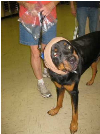
Dojo with a "head wound"