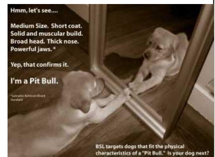
BSL targets dogs that fit the physical characteristics of a "Pit Bull." Is your dog next?

Unfortunately, we have had no adoptions since our last newsletter.