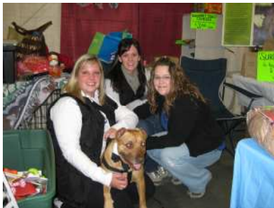
James Bond & his newest "Bond Girls"!