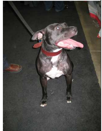
Dioge – thrilled to be there!